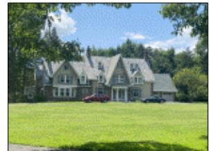
Family Residence, Kinderhook, NY [1961 - 1978]

Known as "The Bristol House" was built in the 1880's by a prominent Claverack hay and coal merchant.