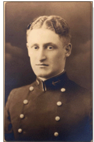
Midshipman, U.S. Naval Academy - 1926

He was educated at U. S. Naval Academy in 1926. He was forced to resign due to color blindness. He resided at 730 North Oakland Street between 1935 and 1940 at Arlington, , Virginia. He was employed as a Marine Engineer, U. S. Maritime Commission in 1940 in Washington, , District of Columbia. He resided at 11 Elm Avenue in 1950 at Newport News, Warwick, Virginia. Residence at Death: 6618 Malta Lane, in Apr 1985, in McLean, Fairfax, Virginia.