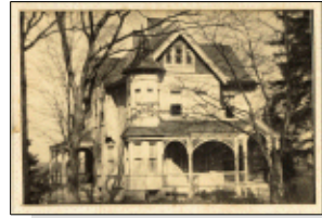
Family Residence, Claverack, NY [1947 - 1960]

Known as "The Bristol House" was built in the 1880's by a prominent Claverack hay and coal merchant.